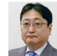
Dean Faculty of Medical Informatics