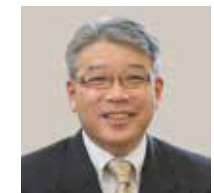
Dean Faculty of Information Media