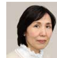
Dean Faculty of Business Administration and Information Science